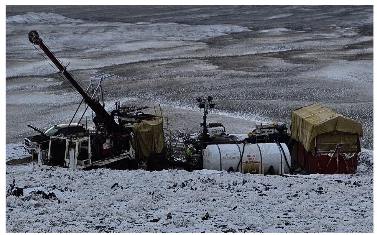
Figure 1: Drill Rig in operation at Black Mountain